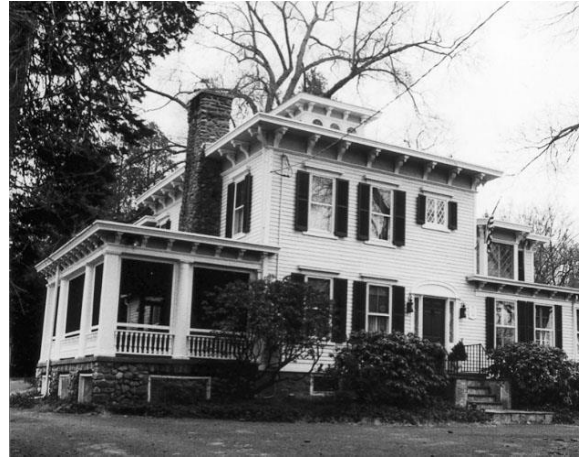
The Aaron Olmstead House c.1868