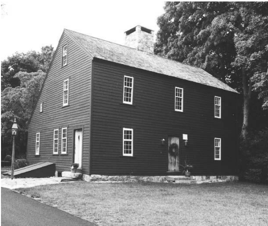
The Jacob St. John House c.1724

Plaques, with the official seal of the Norwalk Historical Society are available through the society for Norwalk houses and other buildings which are 100 years and older. To qualify for a plaque, the building must be documented according to the Historical Society procedures and recognizable as a historic building.