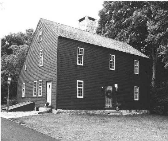
The Jacob St. John House c.1724

Plaques, with the official seal of the Norwalk Historical Society are available through the society for Norwalk houses and other buildings which are 100 years and older. To qualify for a plaque, the building must be documented according to the Historical Society procedures and recognizable as a historic building.